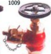
M SCREWED INLET