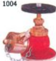
OBLIQUE BS : 336